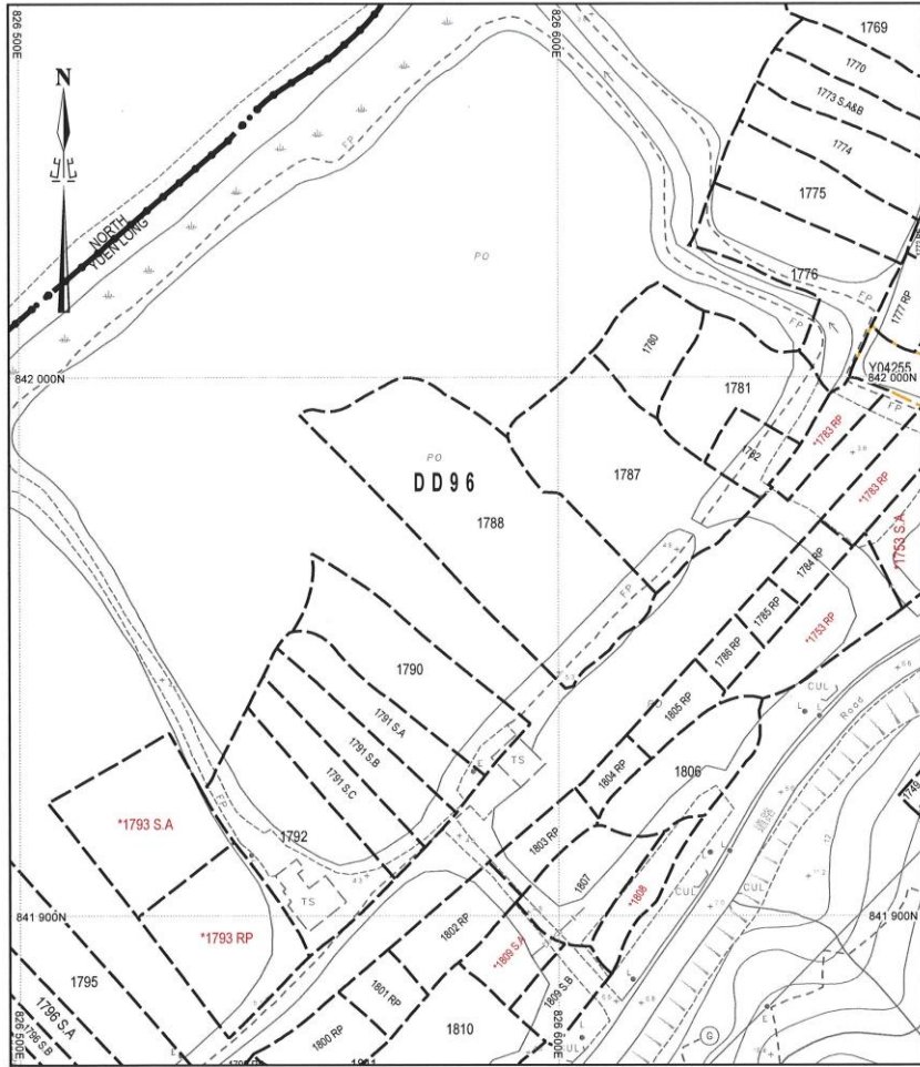
地政總署測繪處 Survey and Mapping Office, Lands Department

比例尺 SCALE 1:1 000 metres 10 0 10 20 30 40 50 metres